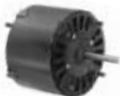
Fig. H D1134