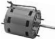
Fig. D D332