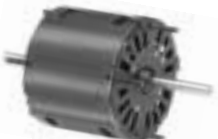
Fig. E D364