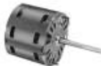
Fig. K D111