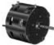
Fig. L D1119