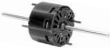
Fig. A D128, D129, D136