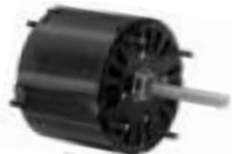
Fig. F D514, D515