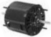
Fig. B D365