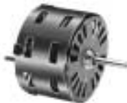
Fig. I D105, D106