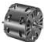
Fig. J D107