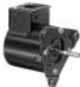
Fig. G D184