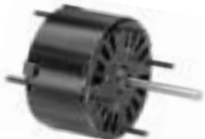
Fig. C D120, D121, D126, D127, D181, D190, D532, D603, D609